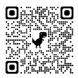
Scan to view video