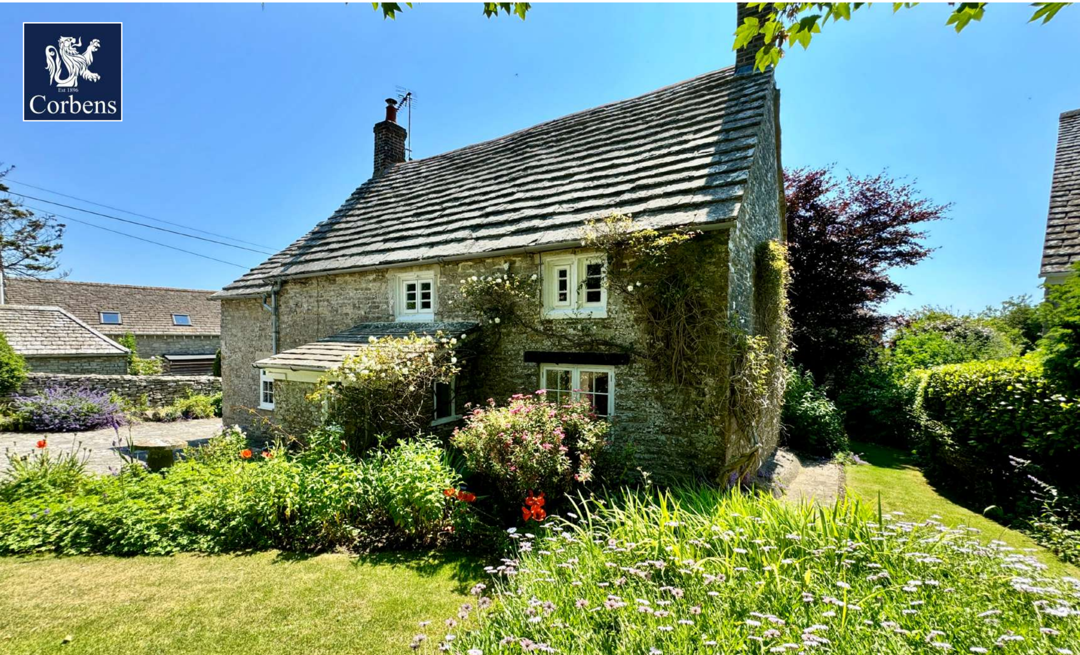
HONEYSUCKLE COTTAGE, WORTH MATRAVERS £895,000 Freehold