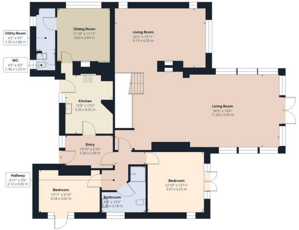
First Floor Building 1