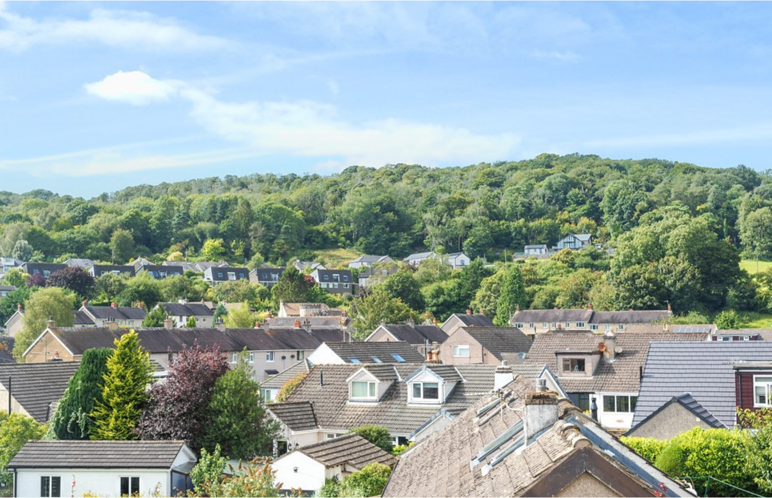
Warton Crag Views