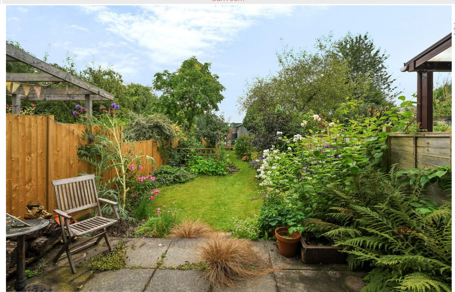
Patio and garden