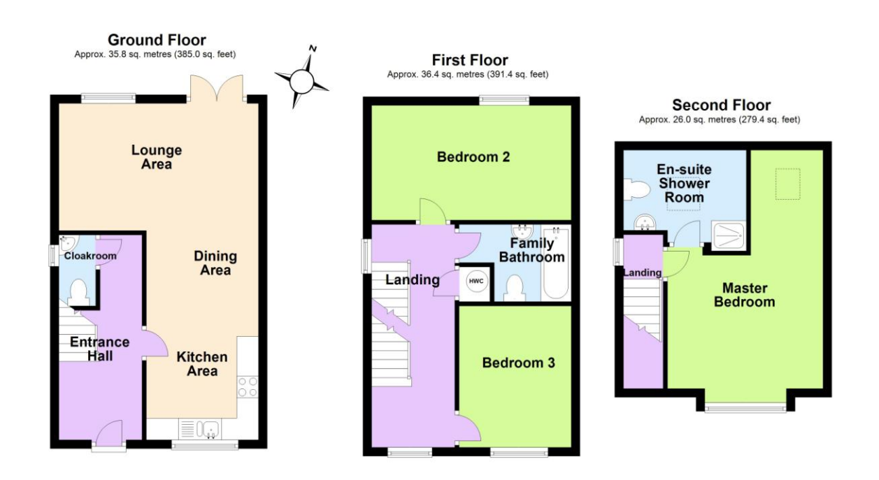
Total area: approx. 98.1 sq. metres (1055.8 sq. feet)