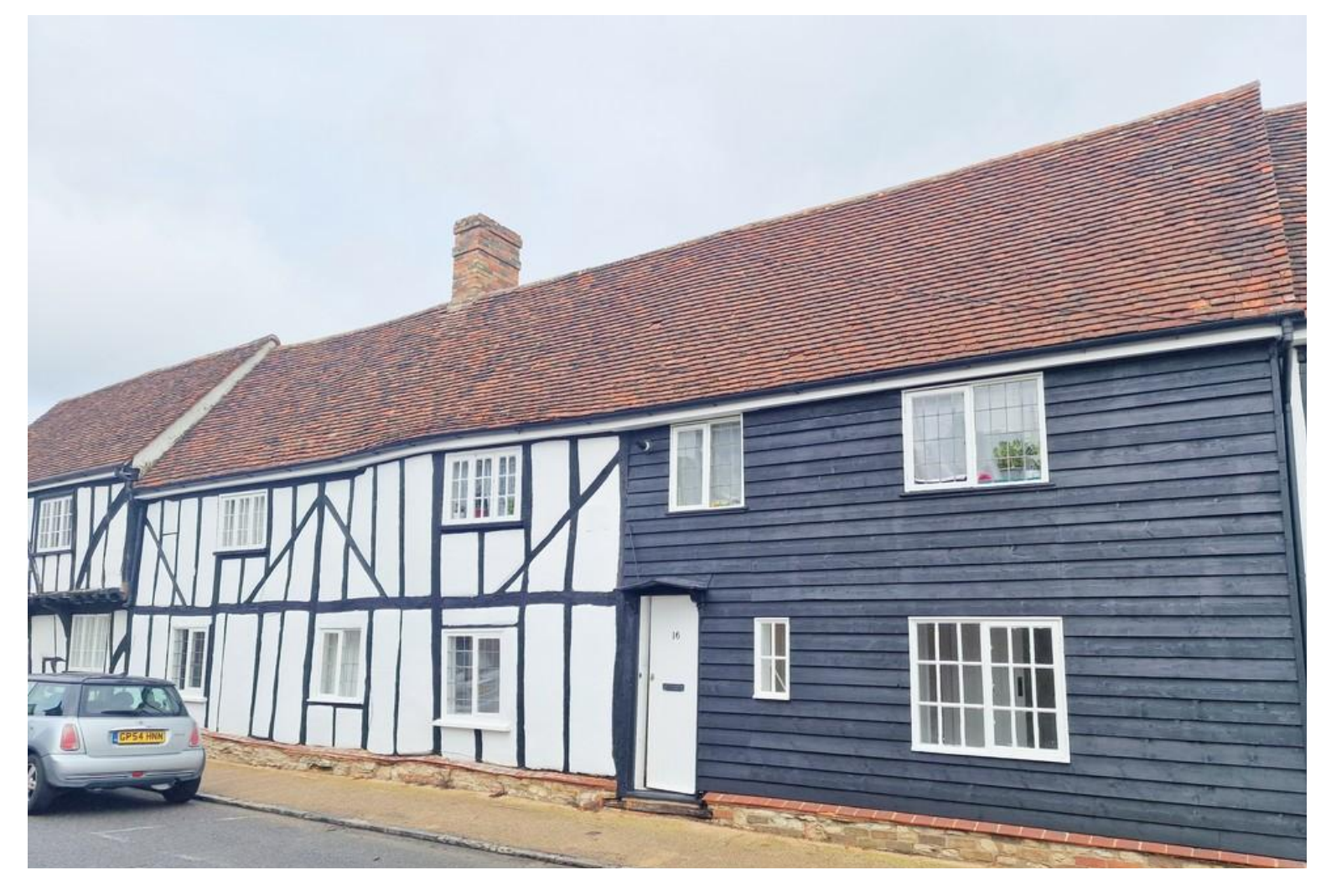
16 Bunyans Mead, Elstow, Bedford, MK42 9XY