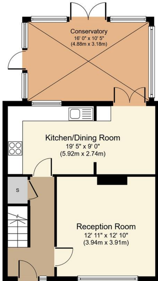
Ground Floor Approximate Floor Area 614 sq. ft. (57.0 sq. m.)