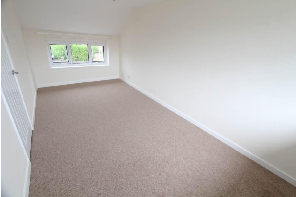
BEDROOM 3: 13' 10" x 6' 8" (4.22m x 2.03m) Panelled radiator. Window to rear elevation.