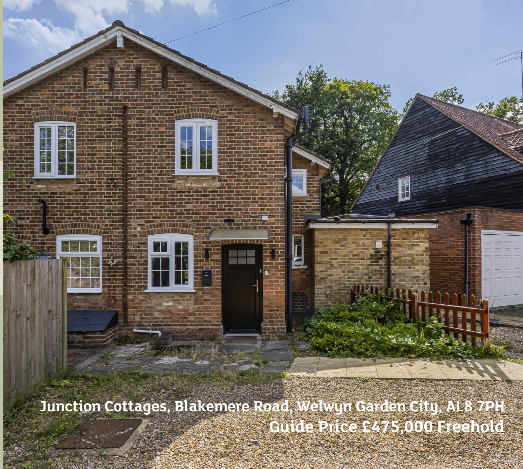
Junction Cottages, Blakemere Road, Welwyn Garden City, AL8 7PH Guide Price £475,000 Freehold

Agents Note: Permit parking on road 9am – 3pm.