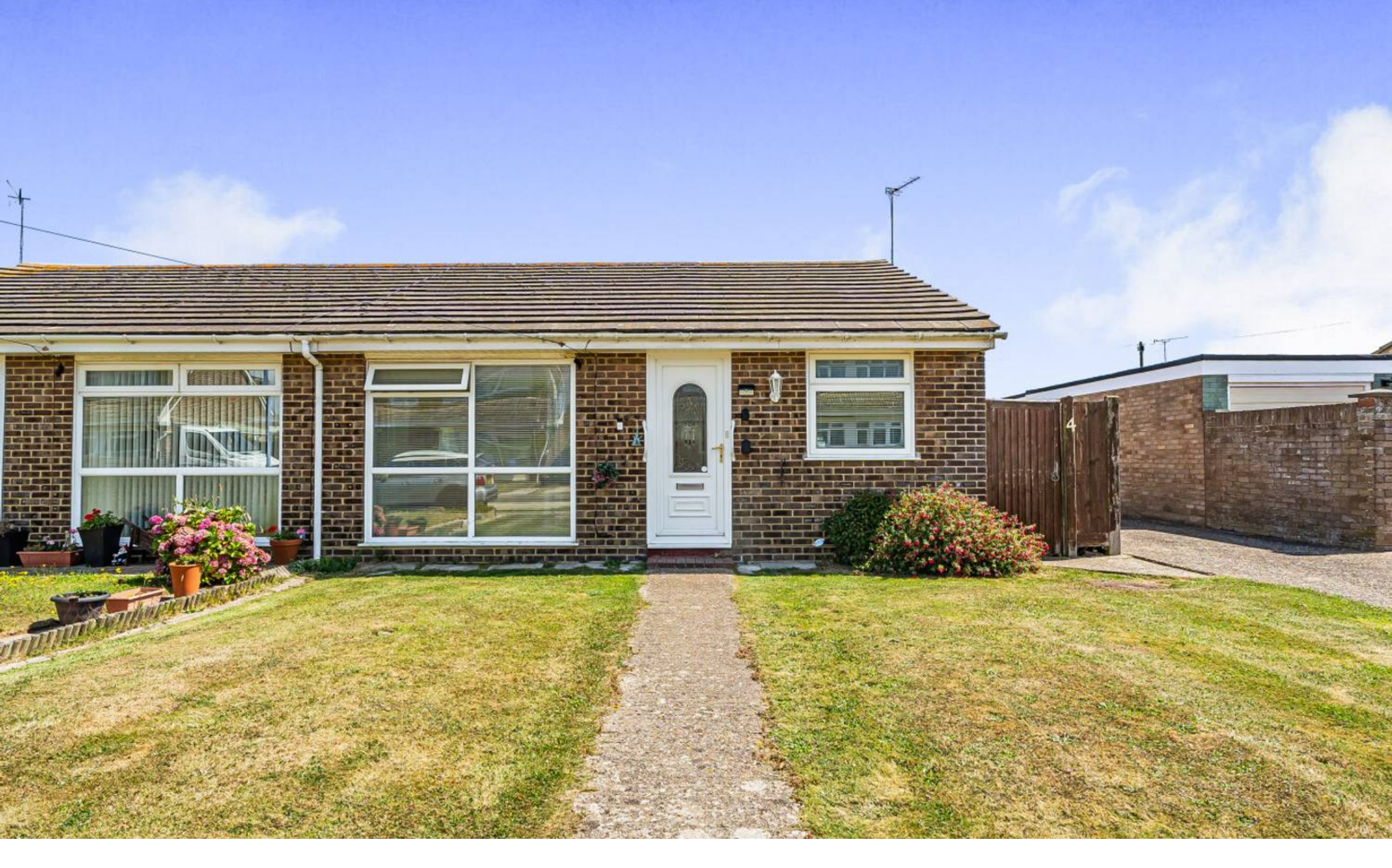
4 Northfield, Selsey Guide Price £285,000 Freehold