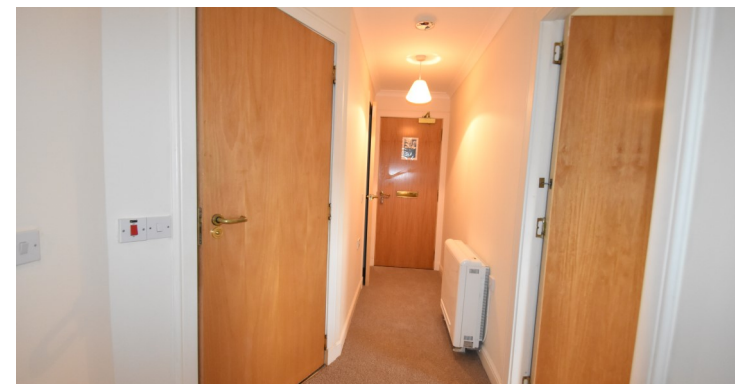
6/27 Roseburn Drive