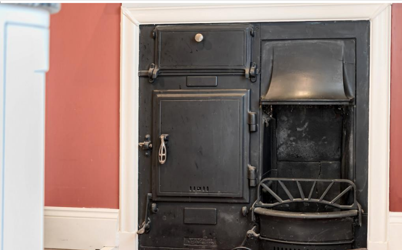
Fireplace in Kitchen