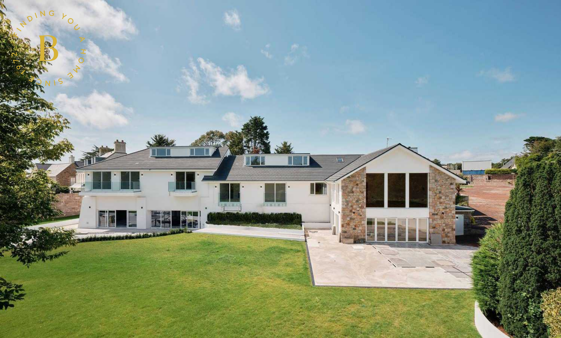
Highgrove House, La Route Orange, St. Brelade £7,950,000

BROADLANDS FINDING YOU A HOME SINCE 1972