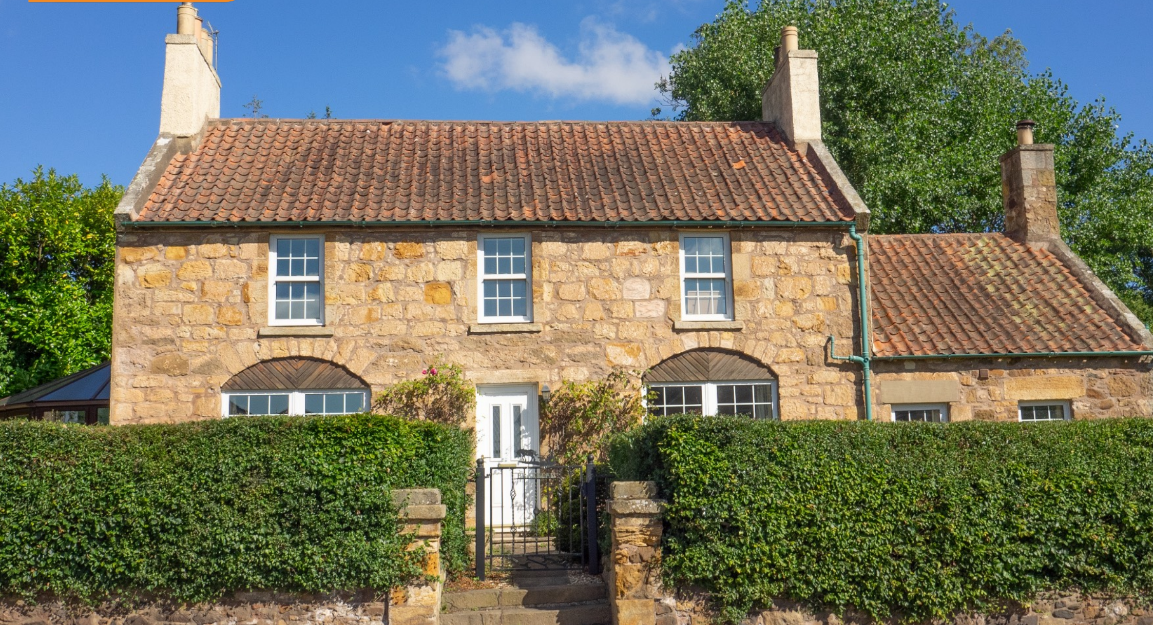
Braehead, West Road, Haddington EH41 3RH