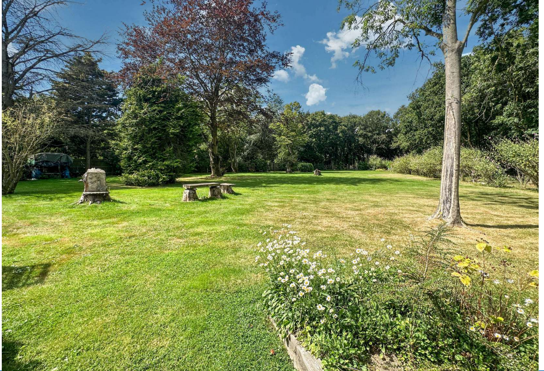
Moor Road, Langham, Colchester, CO4 5NP