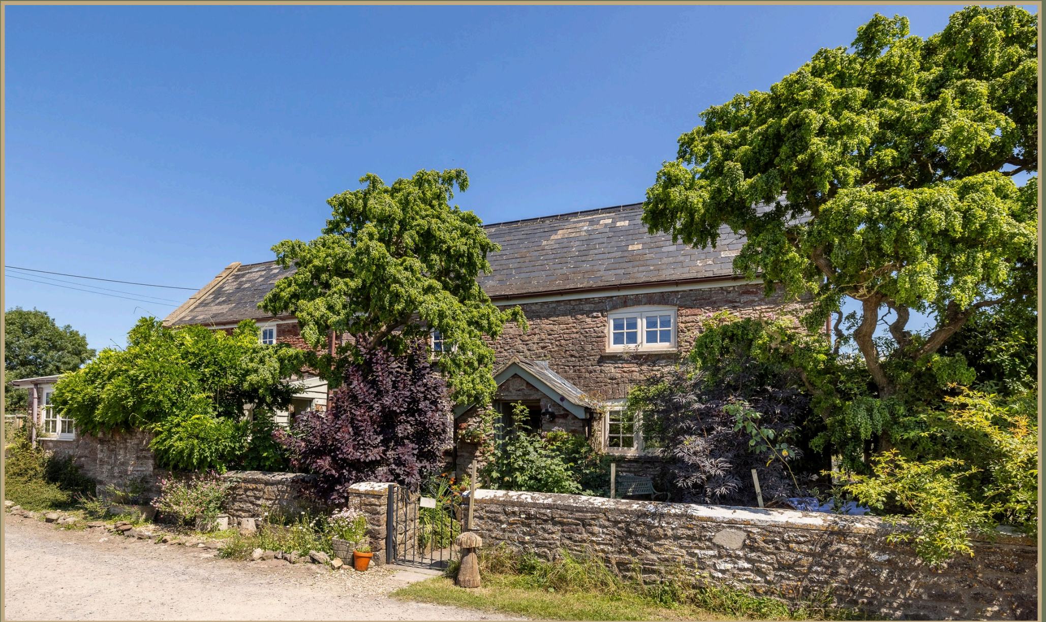
RIVER HOUSE, BARTLETTS BRIDGE, WEDMORE, SOMERSET, BS28 4HH