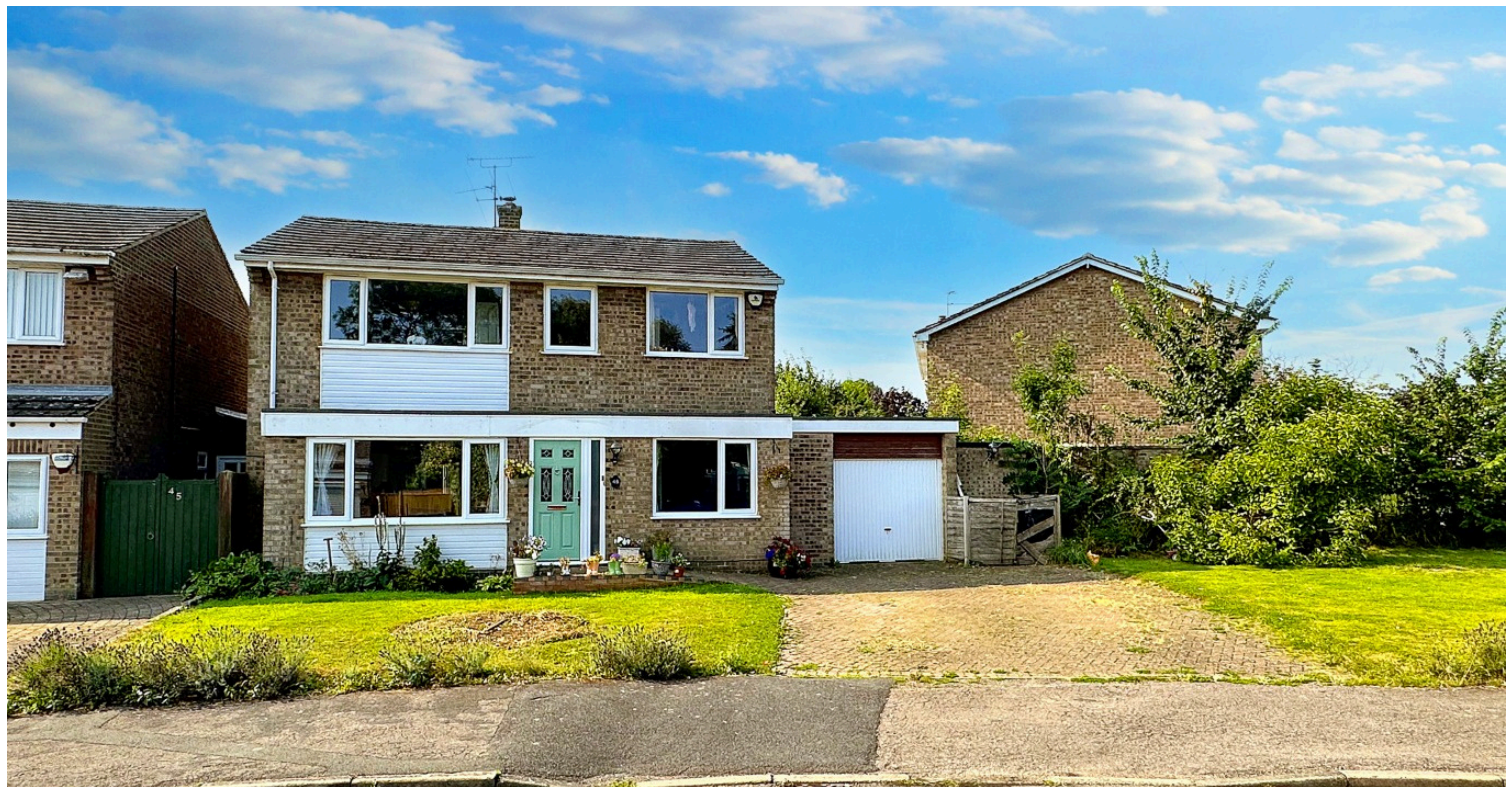
4 Bedrooms | 1 Bathroom | 2 Reception Rooms | Part Garage