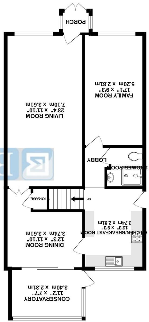
GROUND FLOOR 850 sq.ft. (79.0 sq.m.) approx.

For clarification we wish to inform prospective purchasers that we have prepared these sales particulars as a general guide. We have not carried out a detailed survey nor tested the services, appliances and specific fittings. Room sizes should not be relied upon for carpets, furnishings and appliances. Whilst these particulars are believed to be correct their accuracy is not guaranteed and are given without responsibility. They do not form part of any contract.