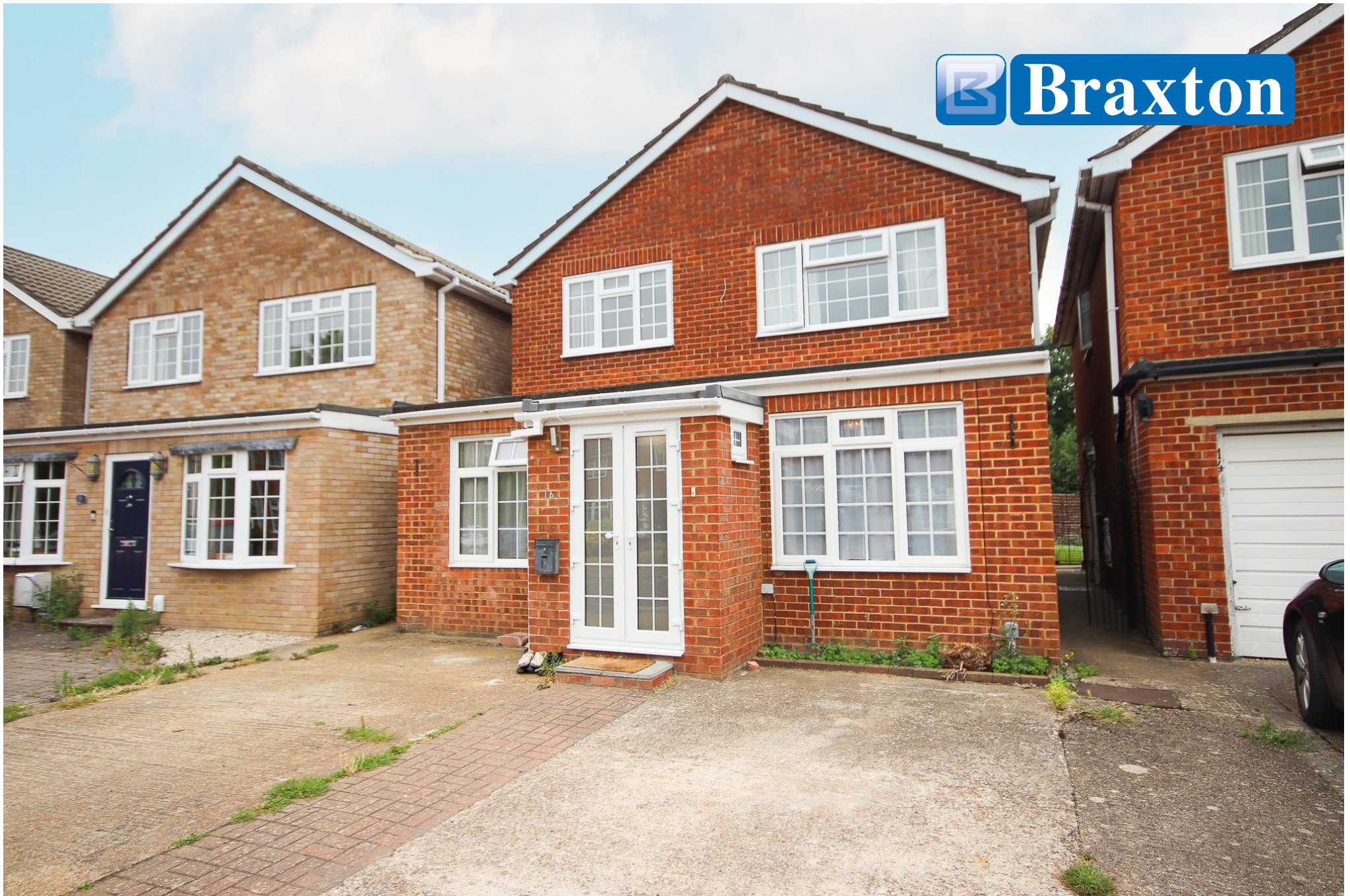
16 Langdale Close, Maidenhead, Berkshire SL6 1SY