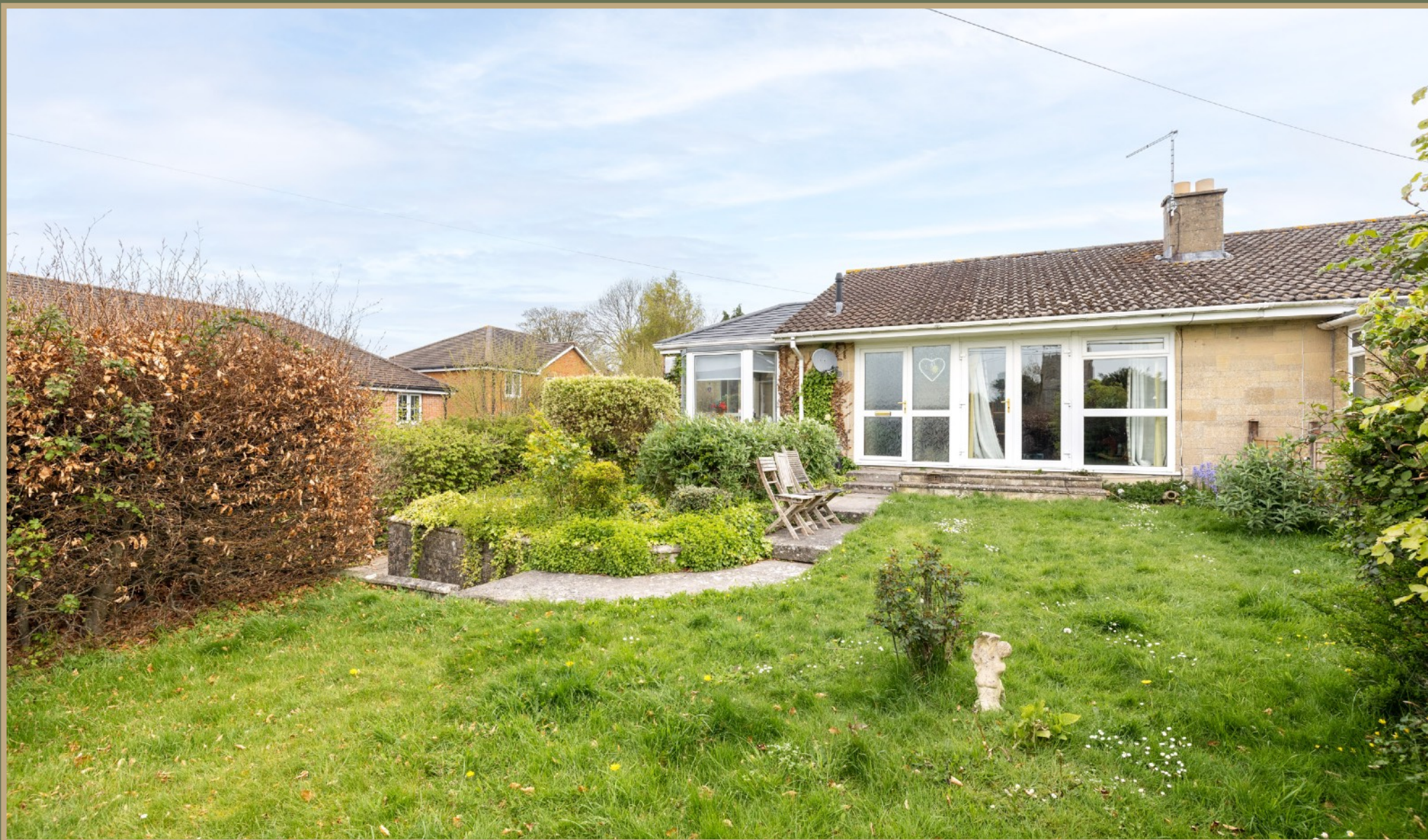
FALLOW END, TUCKERS LANE, CASTLE CARY BA7 7LF