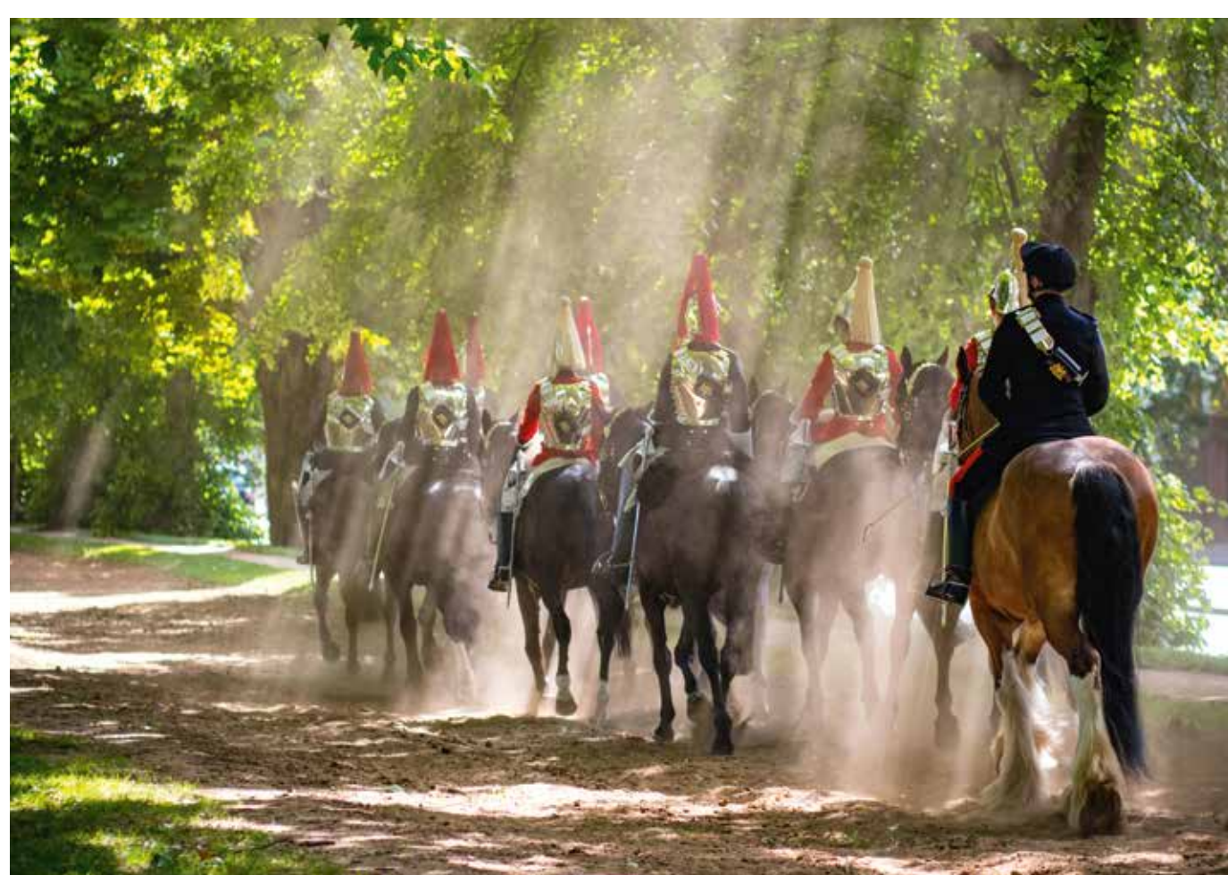
For residents of Park Modern, the park is part of daily life. Hyde Park hosts a range of leisure activities as well as events such as the Serpentine Galleries Summer Pavilion, the British Summertime Hyde Park concert series and Winter Wonderland.