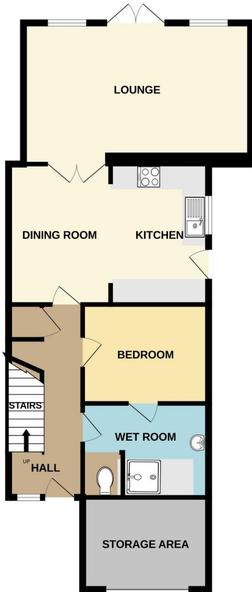
GROUND FLOOR 802 sq.ft. (74.5 sq.m.) approx.