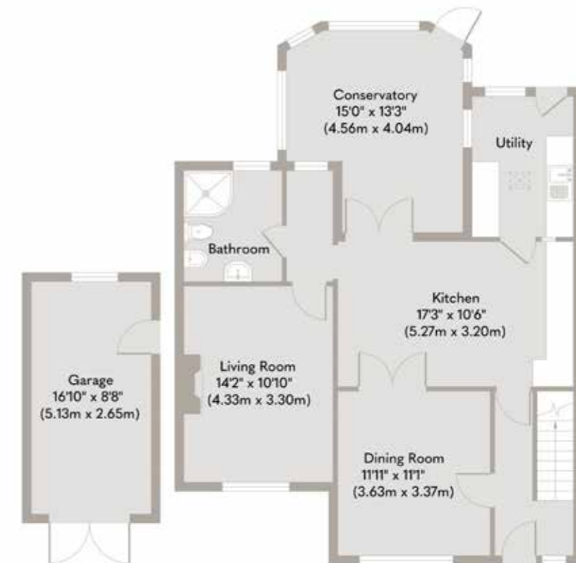
Garage Approximate Floor Area 146 sq. ft (13.59 sq. m)