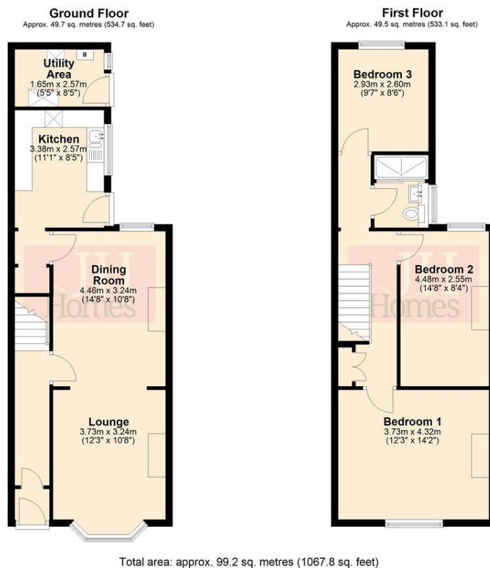
Total area: approx. 99.2 sq. metres (1067.8 sq. feet)