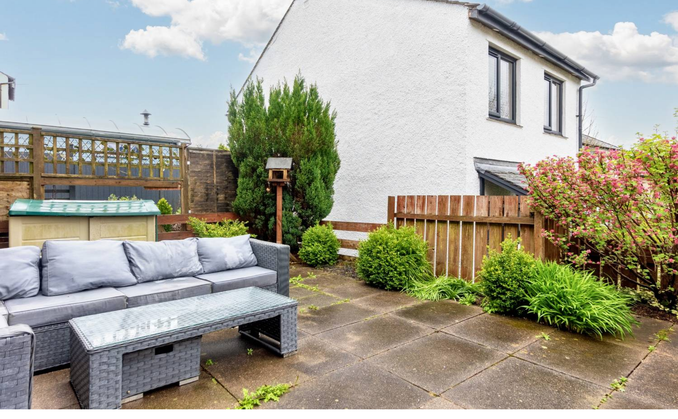
3 Oldfield Court, Windermere £350,000