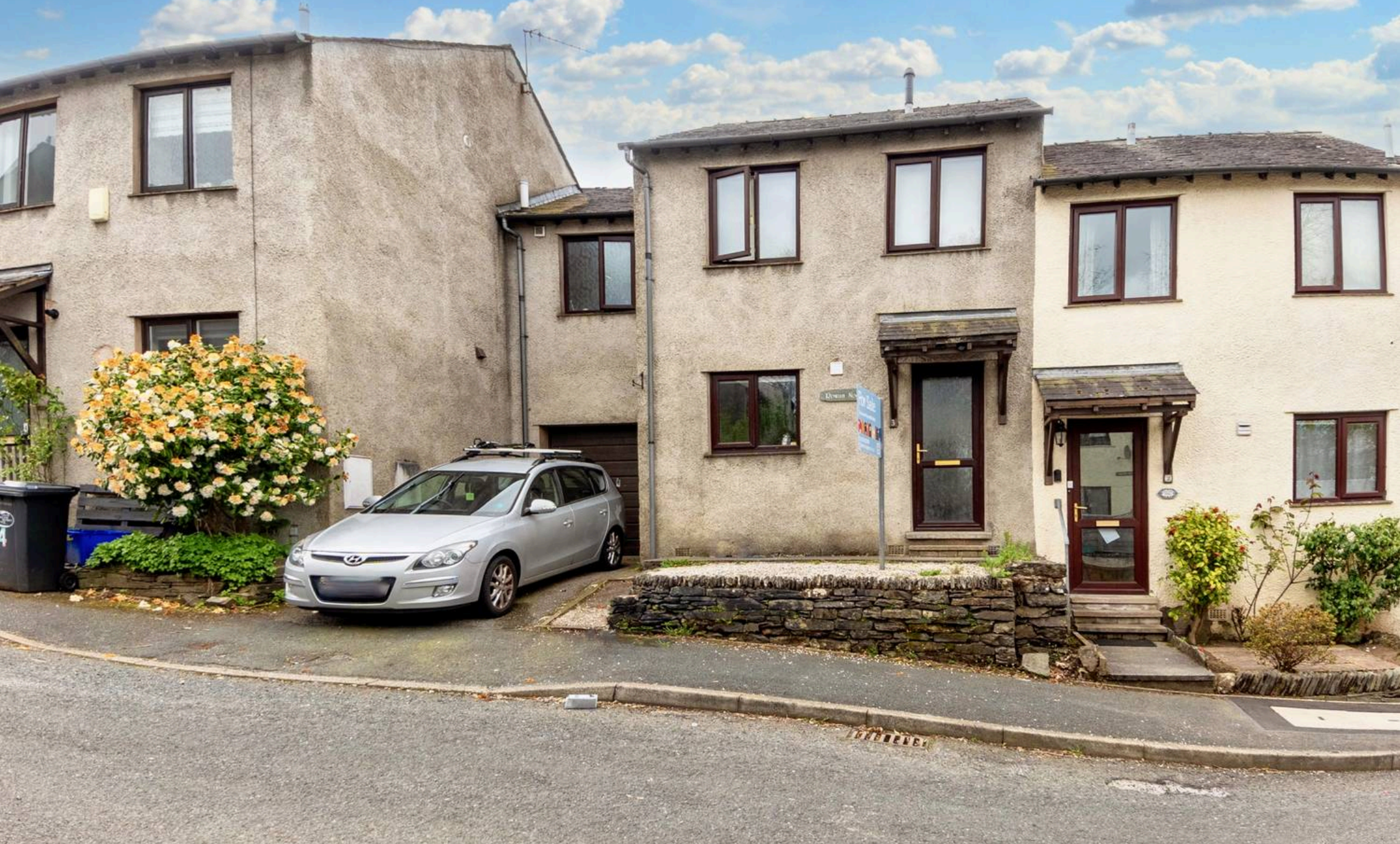
3 Oldfield Court, Windermere £350,000