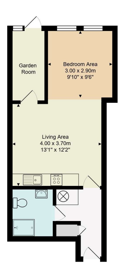
All measurements are approximate and for display purposes only. Approx Total Area: 39.4 m<sup>2</sup> ... 425 ft<sup>2</sup>