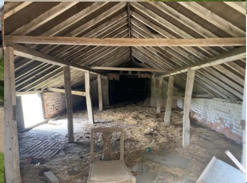
HILL END FARM BUILDINGS, HILL END, UPTON-UPON-SEVERN, WR8 0RN GUIDE PRICE £180,000