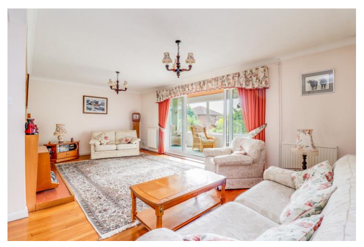
CONSERVATORY 18' 2" x 6' (5.54m x 1.83m) Double glazed windows to side and rear aspects. Two ceiling fans. Electric radiator. Double glazed door to: