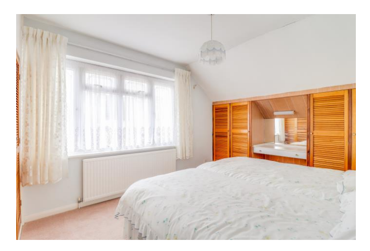
BEDROOM THREE 10' 9" x 9' 5" (3.28m x 2.87m) Double glazed window to front and rear aspects. Fitted wardrobes. Radiator.