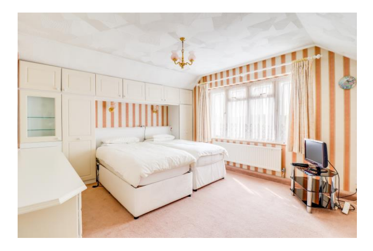
BEDROOM TWO 13' 2" x 9' 10" (4.01m x 3m) Double glazed window to front aspect. Fitted wardrobes. Radiator.