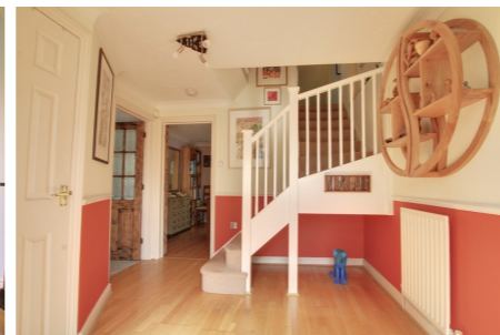
Ground Floor Approx. 115.2 sq. metres (1239.6 sq. feet)