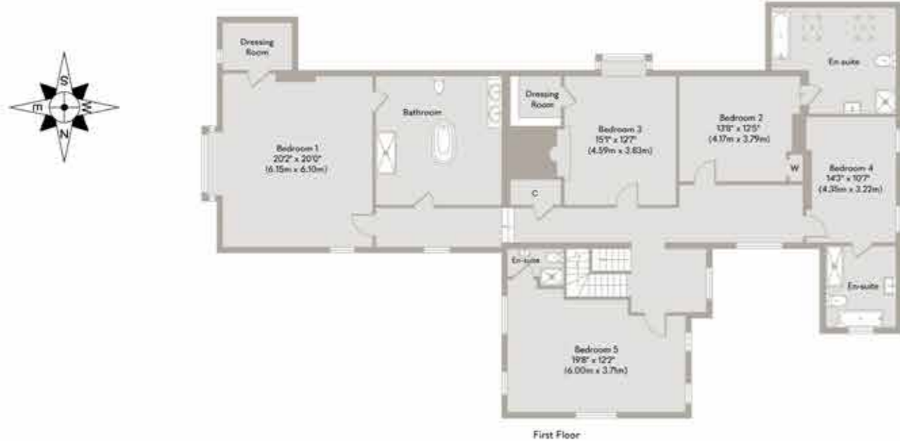
First Floor Approximate Floor Area 2209 sq.ft (205.18 sq.m)