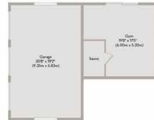
Garage Approximate Floor Area 986 sq.ft (91.57 sq.m)

Whilst every attempt has been made to ensure the accuracy of the floor plan contained here, measurements of doors, windows, rooms and any other items are approximate and no responsibility is taken for any error, omission, or mis-statement. This plan is for illustrative purposes only and should be used as such by any