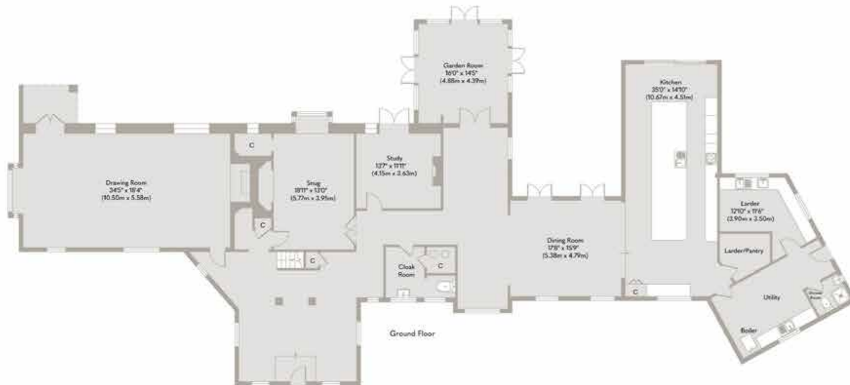
Ground Floor Approximate Floor Area 3632 sq.ft (337.43 sq.m)