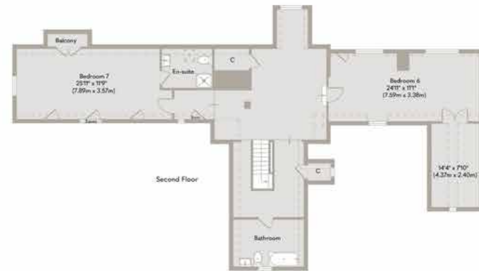
Second Floor Approximate Floor Area 1400 sq.ft (130.09 sq.m)