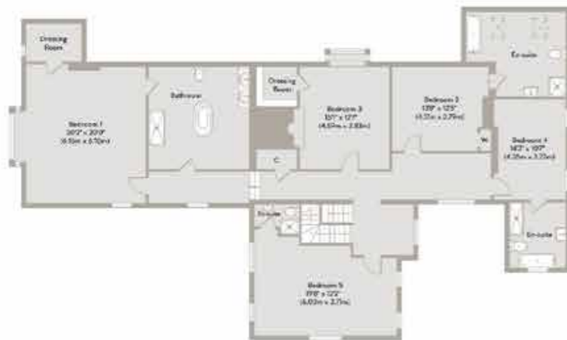
First Floor Approximate Floor Area 2209 sq.ft (205.18 sq.m)