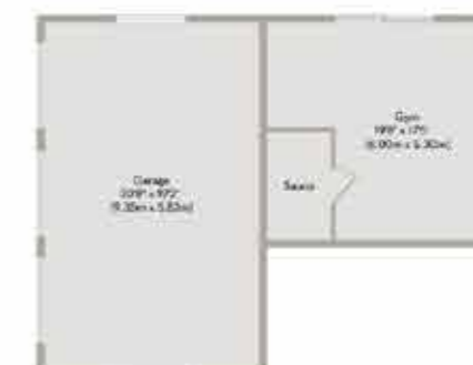
Garage Approximate Floor Area 986 sq.ft (91.57 sq.m)