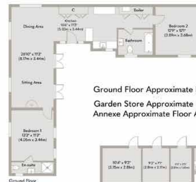
Ground Floor Approximate Floor Area 950 sq.ft (88.28 sq.m)