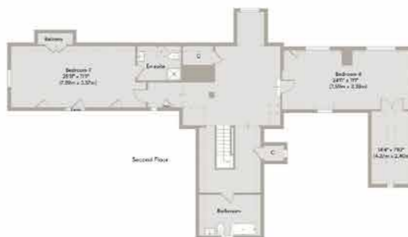
Second Floor Approximate Floor Area 1400 sq.ft (130.09 sq.m)