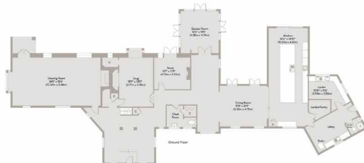
Ground Floor Approximate Floor Area 3632 sq.ft (337.43 sq.m)