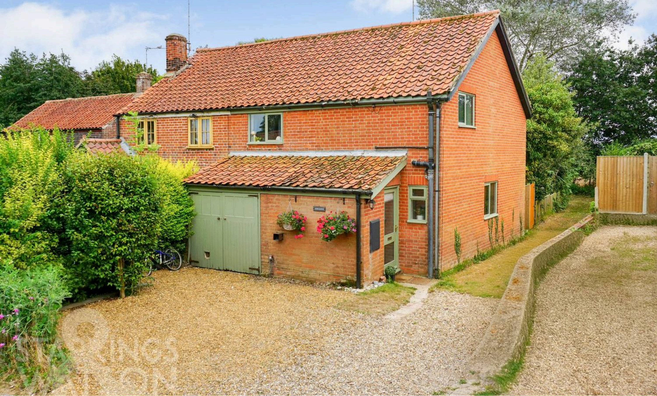
The City, Halvergate - NR13 3PX