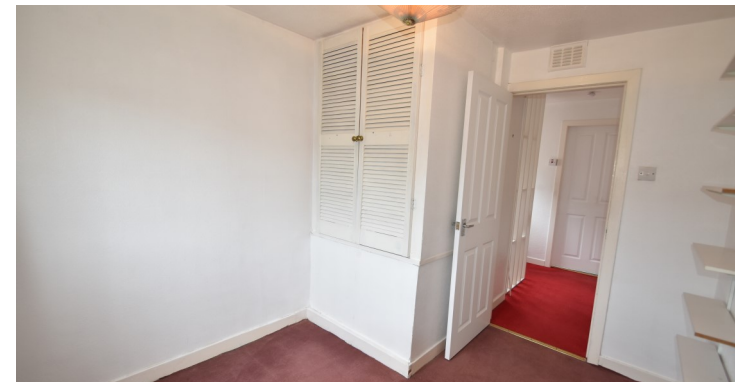
19 Parkwood Gardens