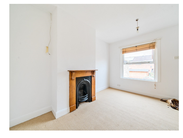
GENERAL REMARKS AND STIPULATIONS:

Tenure: The property is offered for sale freehold by private treaty with vacant possession on completion.