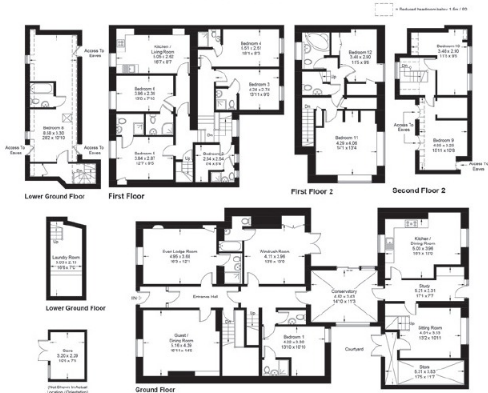
Illustration for identification purposes only, measurements are approximate, not to scale. floorplansUsketch.com © (ID1115588)