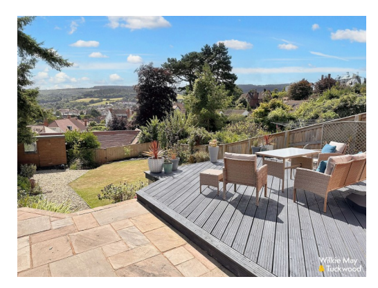
able to offer this beautiful family home.

entrance to the side of the property into a porch with door through to the hallway which has stairs to the first floor, oak flooring, four piece suite... understairs cupboard and doors into the lounge and kitchen dining room. The lounge To the second floor there is a large landing kitchen dining room is another large room a modern fitted shower room. with three windows to the rear and oak flooring. The kitchen area is fitted with a range of wall and base units, sink and drainer incorporated into work surface, integrated range cooker with extractor hood over and space and plumbing for a dishwasher. Off the kitchen is a separate gives access to a rear entrance lobby with part glazed door to outside and off the lobby, a walk-in cloaks/store with low level wc and wash hand basin.