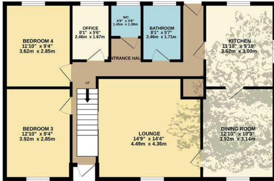
GROUND FLOOR 911 sq.ft. (84.6 sq.m.) approx.