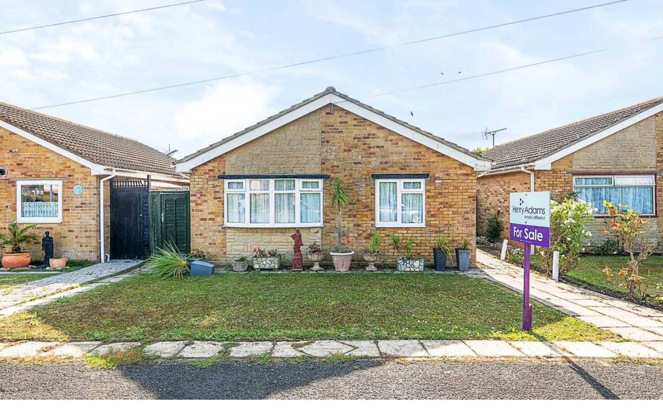
76 Manor Lane, Selsey - Freehold