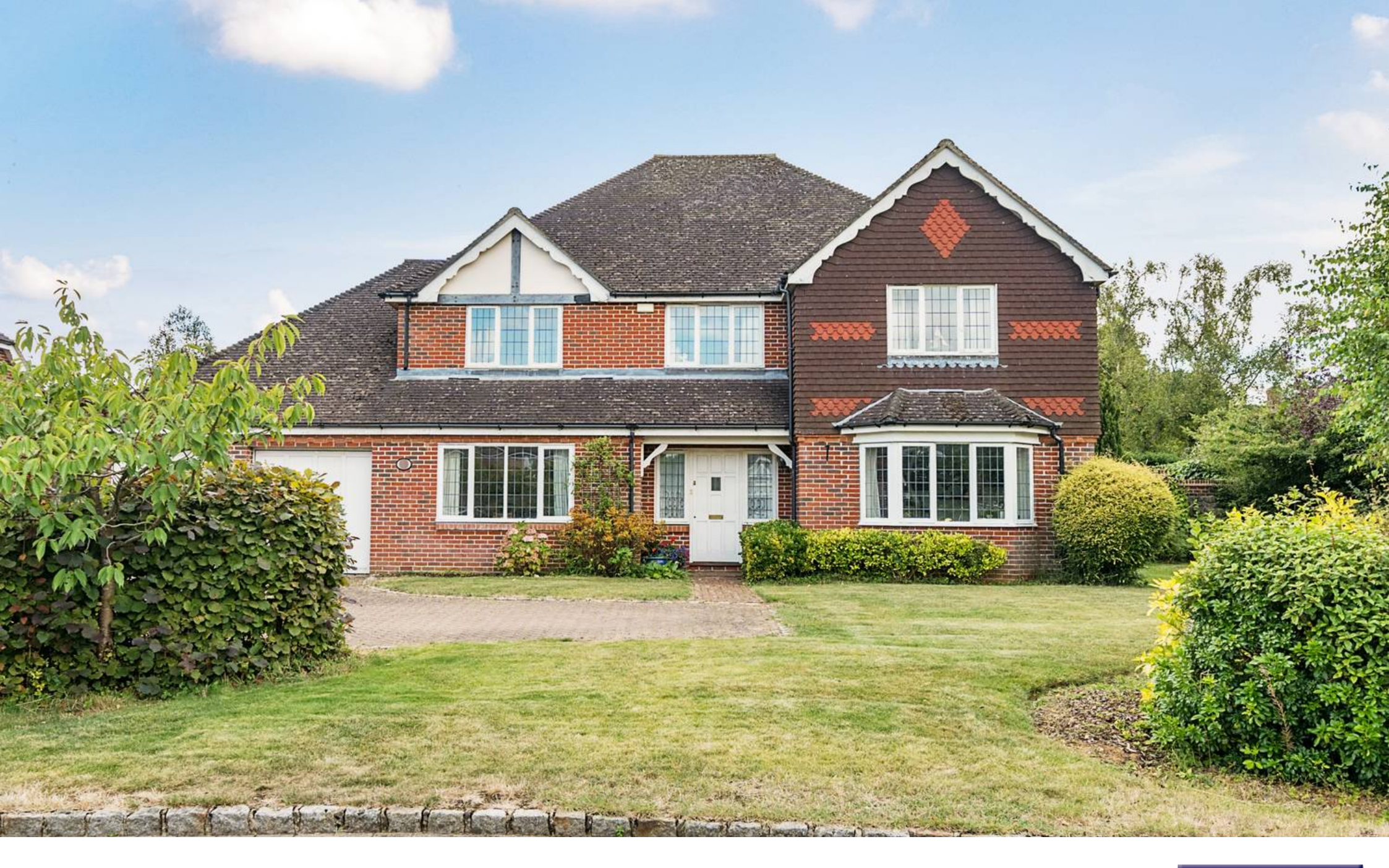
Mayes Close, Warlingham - CR6 9LB