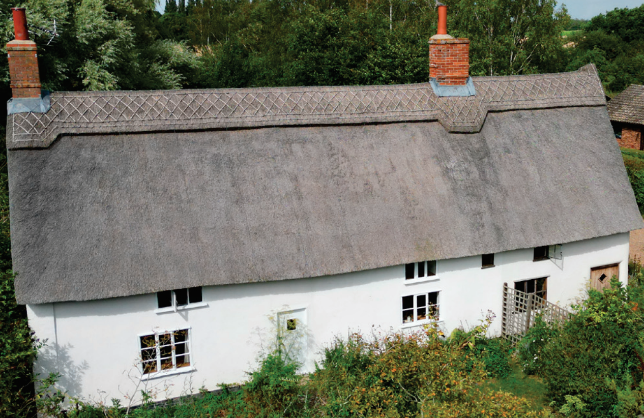
Pleasure Ground Cottage; The Street, Rumburgh, Halesworth, Suffolk, IP19 0NP