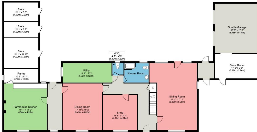
Ground Floor Approximate Floor Area 2,681 sq. ft. (249.1 sq. m.)