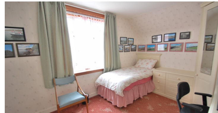
5 Gartcows Crescent