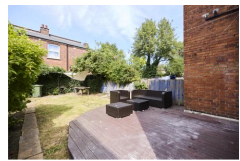
Furness Road, London NW10 £525,000 Share of Freehold

Welcome to Furness Road, a beautifully refurbished two-bedroom property offering a unique blend of modern living and flexibility. This spacious 717 square foot home is perfect for first-time buyers or investors alike, with the potential to be easily adapted into a three-bedroom layout to suit your needs. The property is sold chain-free and includes a share of the freehold, making it an attractive and hassle-free investment. With its own private entrance and access to a charming garden shared with the upstairs neighbours, this property provides both convenience and comfort. Situated just a short walk from Willesden Junction station (Bakerloo Line), commuting is a breeze, connecting you to central London and beyond in no time. Positioned on the borders of Kensal Rise, this home offers a competitively priced opportunity to live in one of North West London's most sought-after areas. You'll enjoy the vibrant community and diverse amenities of Kensal Rise, while also being within easy reach of the trendy neighbourhoods of Kensal Green, Maida Vale, Queens Park, and Ladbroke Grove. From boutique shops and cosy cafes to expansive parks and cultural hotspots, the area is brimming with lifestyle options that cater to every taste. Whether you're looking for a quiet retreat or an active urban lifestyle, Furness Road offers the best of both worlds. Don't miss out on this fantastic chance to own a piece of prime London real estate in a location that truly has it all.