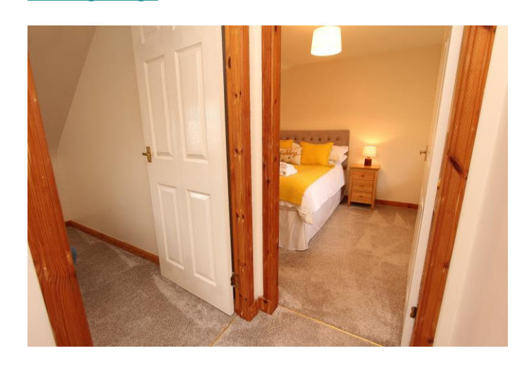
BEDROOM 1: (5.5m - 3.5m at the widest)The bedroom to the rear with CH radiator.