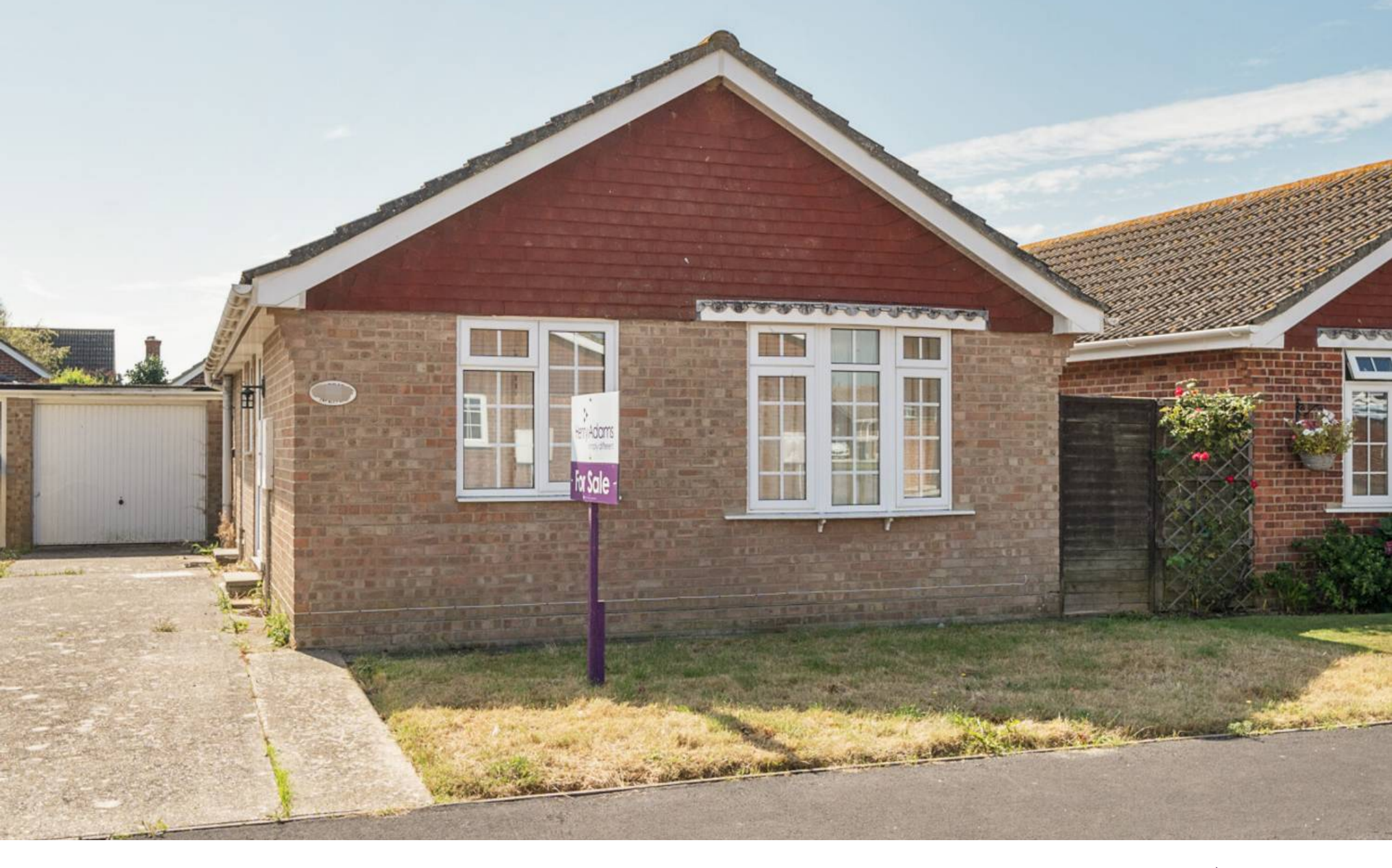
9 Cambridge Avenue, West Wittering Guide Price £325,000