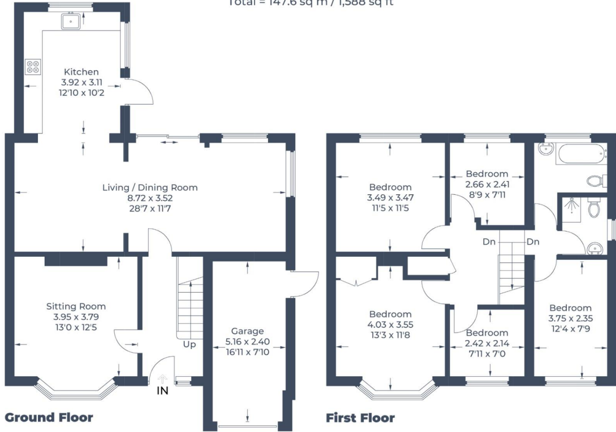
Illustration for identification purposes only, measurements are approximate, not to scale. © ©J Property Marketing Produced for Braxton