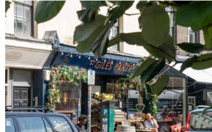
St Giles Pantry.

“A lovely small community within such a central location.”