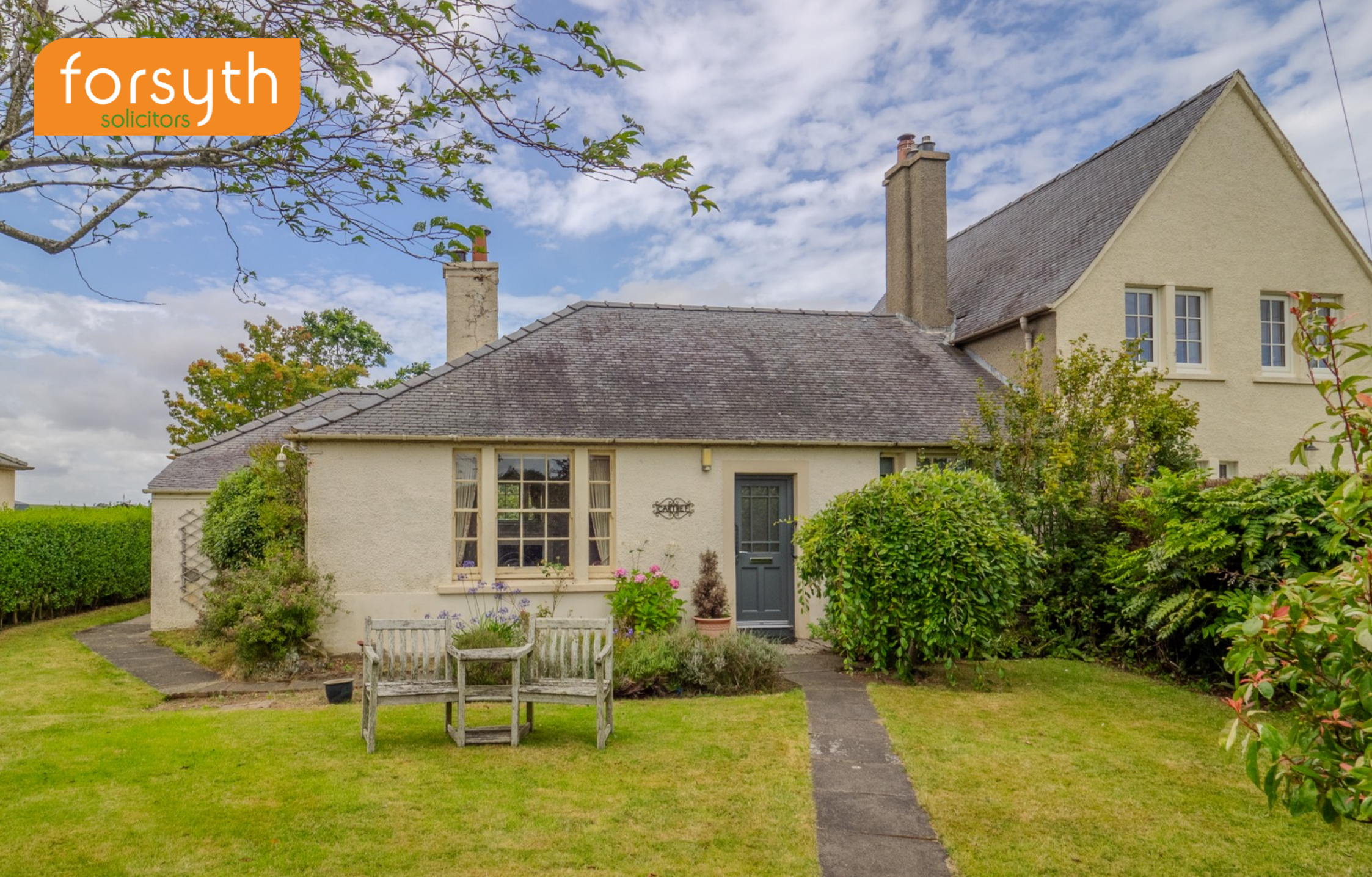
Cartref, 4 Skedsbush Cottages, Gifford EH41 4JP