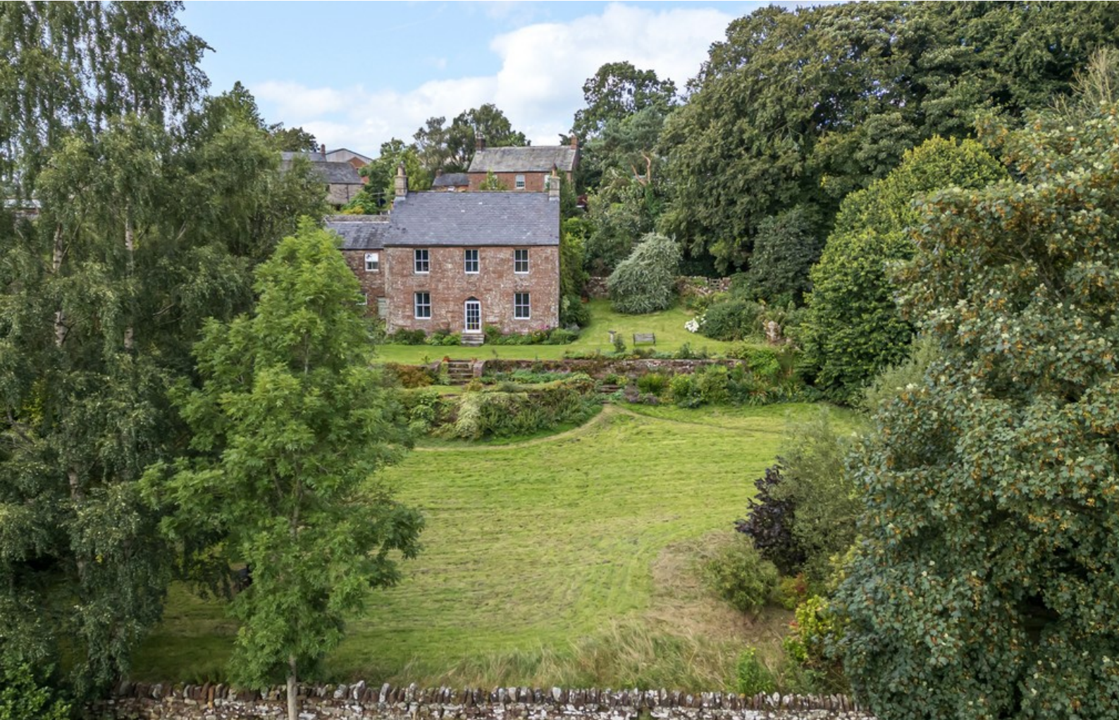
Rear Aspect and Garden